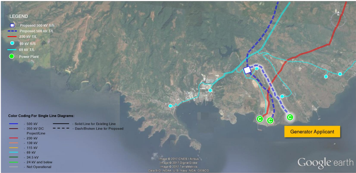
Geographical Map Sample 1